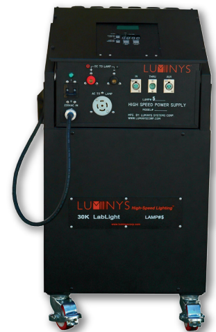
LabLight Power Supply